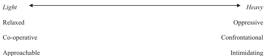
Figure I: The ‘heavy–light’ continuum

Expressed in this way, and as described above, one would expect prisoners to favour prisons that are ‘light’ to those that are ‘heavy’. Yet, in responding to a detailed survey, prisoners in three of the five private sector establishments in our study rated their prison experience consistently more negatively than prisoners in comparable public sector prisons (see Crewe, Liebling and Hulley 2011). Our contention is that, at their most ‘under-weight’, and where staff – and staff authority – were absent , private sector prisons provided a less positive environment for prisoners than public sector establishments which were slightly ‘over-weight’ but in which staff power was ‘present’.